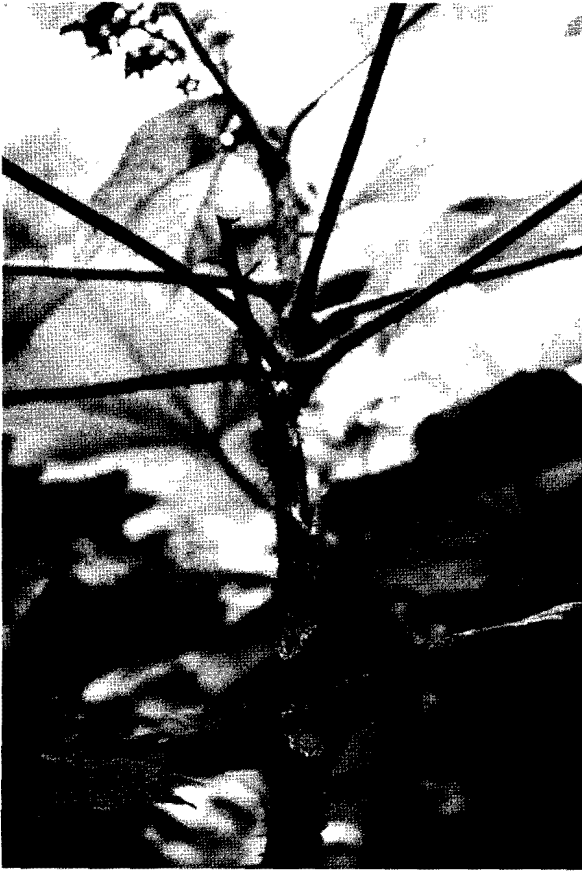
FIG.2— Devil's-club stem, showing thin, sharp spines. Approximately 1/5 natural size.

medicinal preparations, usually herbs, which are administered by herbal specialists within a family or village group; and 2) spiritual, i.e., the "magical" or supernatural practices of shamans, or "Indian doctors," who deal more with the evil spirits associated with illness than with its physical manifestations (Turner et al. 1980:150; Turner and Efrat In Press; Turner et al. In Press). Devil's-club played, and still plays, an important role in both of these types of medicine, although in some instances the two are so closely intermingled that separating them completely would be unrealistic. Nevertheless, for the purposes of this paper, it is a useful dichotomy and examples of the use of devil's-club in these two aspects of medicine are given in Tables 1 and 2 respectively.