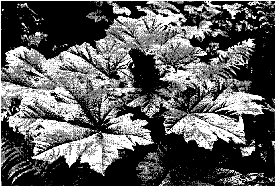
FIG. 1—Devil's-club ( Oplopanax horridus ). Approximately 1/6 natural size.

Devil's-club is a deciduous shrub of 1-3 m (or more), with long, thick, ascending or decumbent stems and large, palmately lobed leaves with blades up to 40 cm or more wide, irregularly serrate margins, and long petioles (Fig. 1). They superficially resemble large maple leaves. The stems, petioles and leaf veins are densely armed with thin, sharp spines 5-10 mm long (Fig. 2) that are highly irritating and can fester when imbedded in the skin. Some individuals experience a severe allergic reaction to them. The small, greenish-white flowers bloom from May to July, depending on elevation and latitude. They are subsessile in compact umbels borne in elongate racemes or panicles up to 25 cm long. The fruits are bright red, fleshy berries, somewhat compressed, ellipsoid, and often spiny (Hitchcock et al. 1961 (Pt. 3):506).