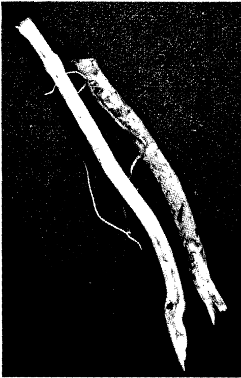
FIG. 3—Dried, de-spined devil's-club sticks, kept for use as medicine for flu, excess weight loss, and other ailments, by Annie York, a Thompson woman from Spuzzum, B.C. Approximately 1/4 natural size.

One was a Chief of one of the Alaskan villages who took it for a red, painfully swollen finger that was unreleived by the prescribed treatment of aspirin, raising the hand, and heat. He took one glass of devil's-club extract, which relieved the symptoms completely in eight hours. Another was a case of four teenagers who used the dried inner bark laid directly into a tooth cavity and experienced prompt pain relief. Adult males reported that they had applied the stalk strips to axe wounds received in the bush, sufficiently relieving the pain to enable them to continue on until they came to medical attention. Yet another case is described by Justice (1966:38) where a male patient with metastatic adenocarcinoma [secondary malignant tumour] was discharged from the hospital with a few month's prognosis and a terminal supply of morphine. Three years later, he had regained his health and strength after extensive treatment with devil's-club extract.