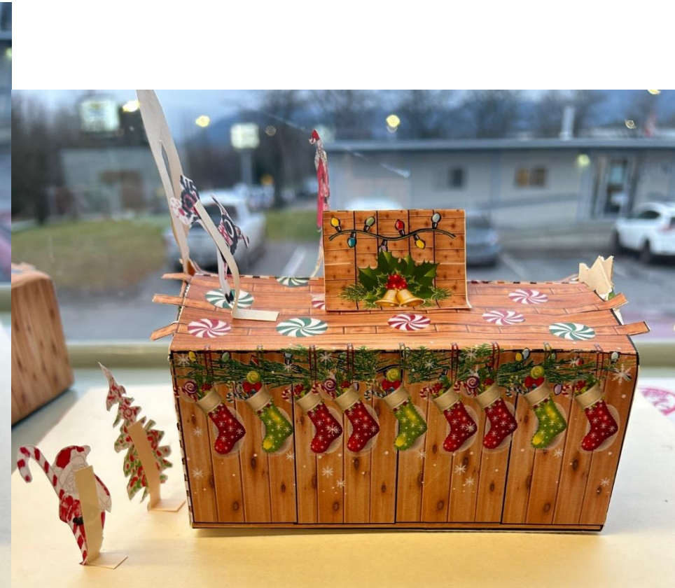
Photos of finished Christmas Longhouse