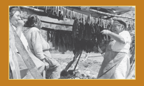
→ DID YOU KNOW? ← THERE ARE APPROXIMATELY 44,300 SELF-IDENTIFIED MÉTIS PEOPLE LIVING IN BC.

Currently, there are two main categories of legal standing for First Nations in Canada: status Indians and non-status Indians. Status Indians are registered with the federal government and are governed by the Indian Act. Registering can affect a status individual's residence, taxation and education. Non-status Indians are not registered and are not governed by the Indian Act. There are approximately 105,000 status Indians and 75,000 non-status Indians in BC today. Together, they account for approximately 5% of the population of BC.