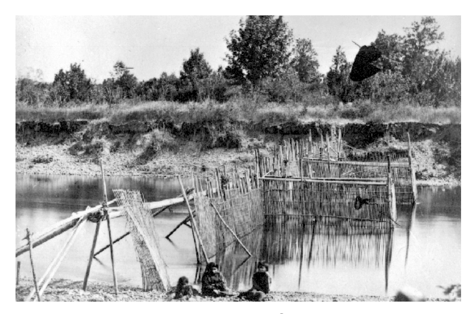
Figure 1. Fish weir on the Cowichan River.

Weirs are constructed on shallow slow-moving rivers. Typically, river weirs are fence-like structures that obstruct the path of salmon on their migratory journey. Weirs consist of several large stakes lodged into the river bed at intervals. These posts are pounded into place with a piledriver. Lattice work is intertwined between the stakes to form a fence impenetrable by fish. Typically, the latticework is made of cedar boughs, maple saplings, or other available resources. The stakes are permanently put into the ground; however, the lattice work is removed after the salmon run to avoid damage. Figure 1 shows a picture from the BC Archives website of a fish weir on the Cowichan River.